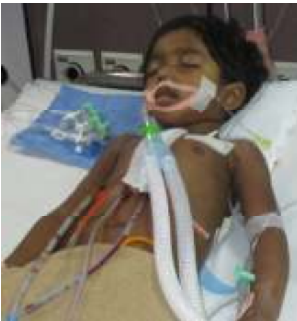
Suranjana, 2.6 Years, female, referred by RC Palghat East admitted at AIMS on 26 Oct underwent open heart surgery on 31 October 2016