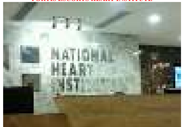
NATIONAL HEART INSTITUTE