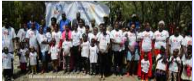
21 children who underwent open heart surgeries at Delhi, India, re-assembled for get-together to 'celebrate life' at Lusaka on 10 September 2016