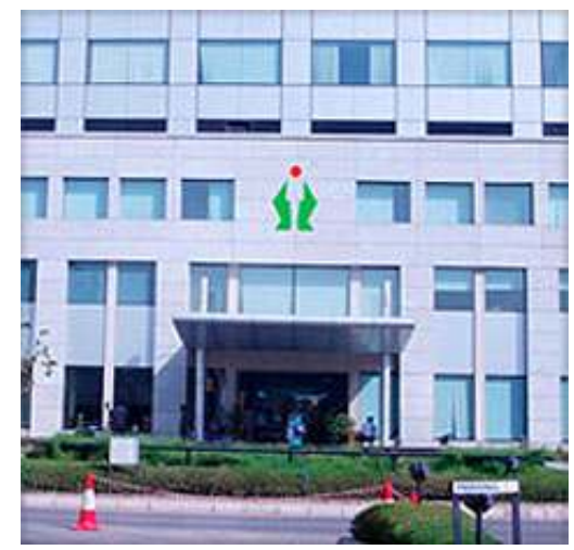
FORTIS ESCORTS HEART INSTITUTE