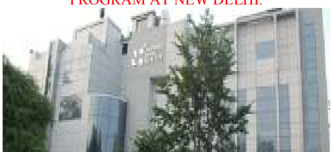
NATIONAL HEART INSTITUTE