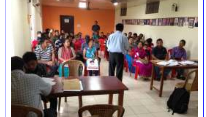
A view of the interaction-session organised by RC Imphal on 30 July with parents of GOL children to plan their journey to Delhi in August 2015 for open heart surgery.