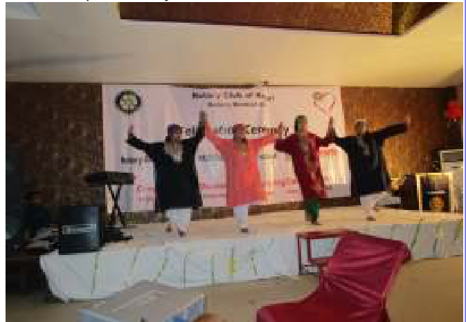
A scene from the cultural program organised during the public meeting after the CHD camp at Jammu, J & K on 28 March 2015

The Directors of Health Services of Jammu as well as Kashmir regions were present. Inspector General of Police and large number of bureaucrats including from Health Department joined.