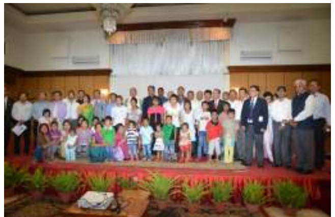
Group photo 3 of GOL Manipur children