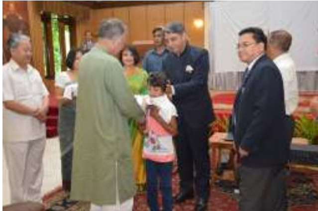
Manipur State Governor meeting GOL children