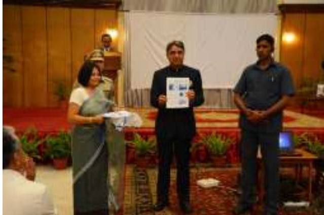
Governor, Manipur releases 'Gift of Life' bulletin No 32 Guv felicitates children treated under Rotary's 'Gift of Life' programme