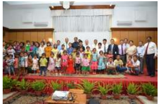
Group photo 2 of GOL Manipur children