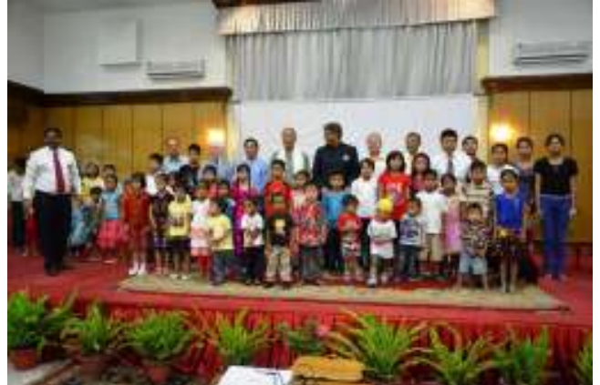
Group photo 1 of GOL Manipur children